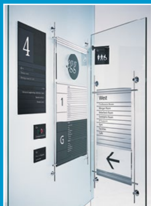
HB Modular Sign System