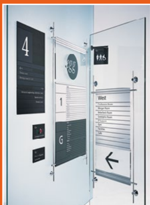
HB Modular Sign System