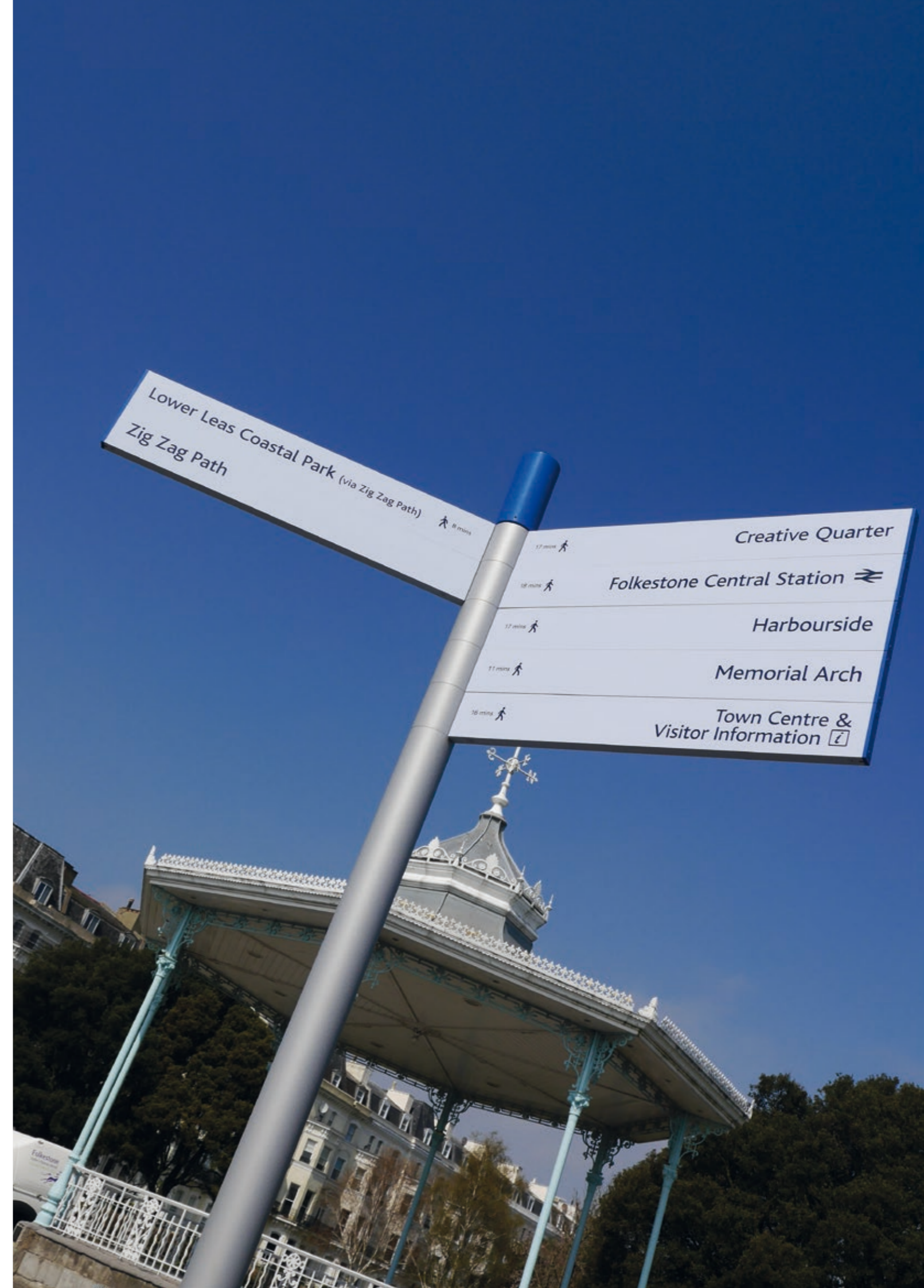
Right Octopus fingerpost at Folkestone

Octopus is designed to compliment the Chameleon monolith sign system, to provide a complete wayfinding solution for the outside world.