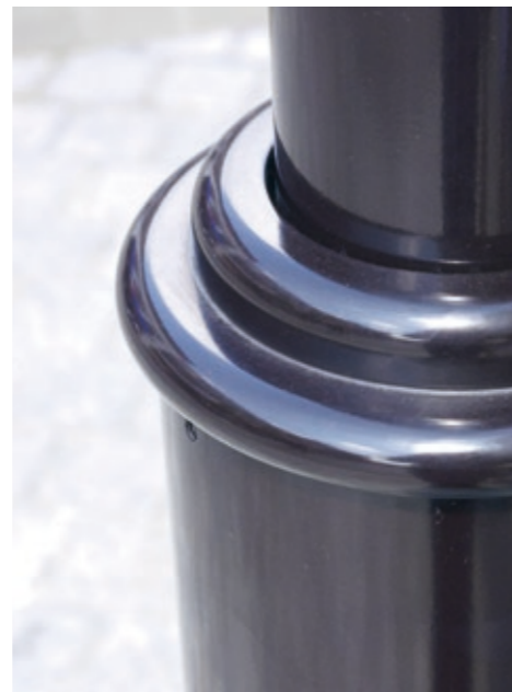
Left Octopus fingerpost with added decorative collar and post dressing to create traditional looking fingerpost.