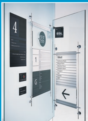
HB Modular Sign System