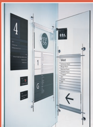
HB Modular Sign System