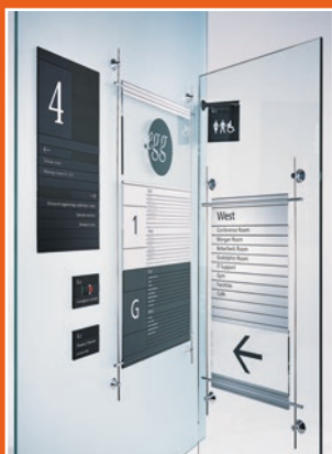
HB Modular Sign System