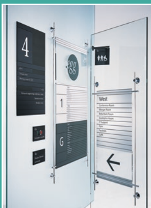
HB Modular Sign System